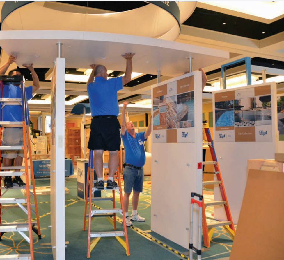
Exhibit installation & dismantle

Shipping to the advanced warehouse is the most cost effective way to transport your exhibit. Advanced warehouse is an off-site warehouse where exhibitor freight is stored until show set-up begins. Shipping to the advanced warehouse ensures that your materials are secure and guarantees that the materials will be moved to your booth space before installation teams arrive. You also reduce costlier risks, such as marshalling yard fees and overtime installation charges if the booth materials are late. The window of time in which materials may arrive at the advanced warehouse is typically 45-60 days before a show.